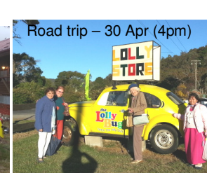
Road trip – 30 Apr (4pm)