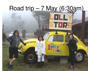
Road trip – 7 May (6:30am)