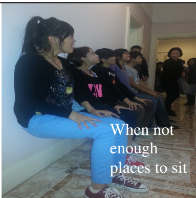
When not enough places to sit

facing our generation is that of identity crisis. This affects Christians and non Christians alike. When everything else is stripped away from you, who are you? What remains? When all your titles and labels are taken away, what's left of you? Will you be able to remain standing, secure, unshakeable and solid? How you answer these questions determines how you live your life. There are people whose identity is based entirely on what went wrong in their past, on their circumstances, and on names and labels they got stuck with that cripple and limit them from living fulfilling lives as God intended them to live. The devil is a thief, one of the things he aggressively steals is your God given identity and destiny.