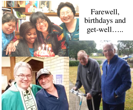
Farewell, birthdays and get-well.....